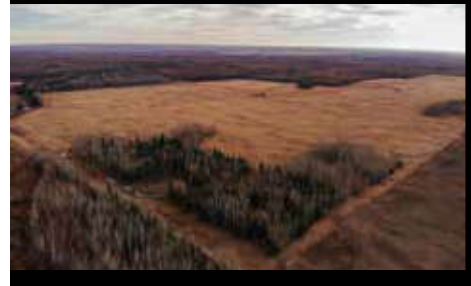
A-7 NE 32 63 24 W4