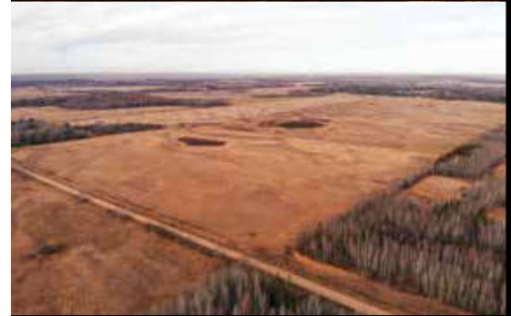
A-9 SW 29 63 24 W4