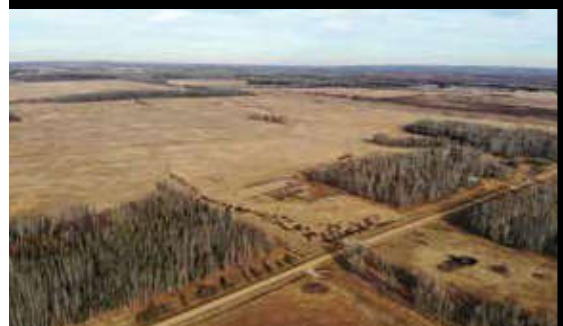
A-3 SW 6 64 24 W4

20 acres treed, 84 Acres barley/oat mixture for silage, remainder pasture, wet well & pond taxes $183.42