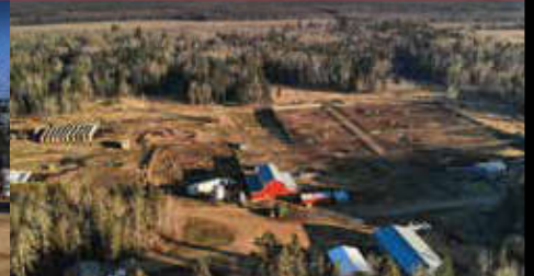
A-1 SW 32 63 24 W4 HOME QUARTER

1884 +/- Sq Ft Home – 635017 Rg Rd 245 (Meadowbrook), AB