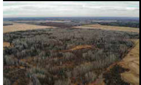
A-5 SW 31 63 24 W4