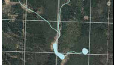
A-10 GRAZING LEASE