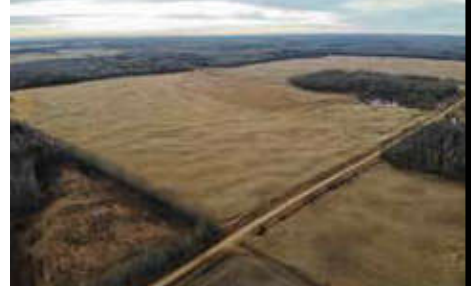
A-5 NW 31 63 24 W4