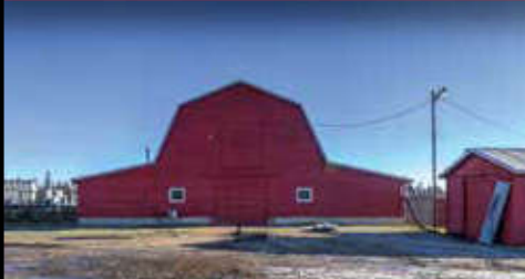
32X60 BARN W/ 14X60 LEAN-TO EXTENSION(S)

OPEN HOUSE DATES: January 26, 2-4PM & February 12, 2-4PM