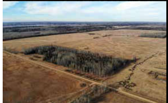
A-2 SE 1 64 25 W4

SW 7 is open corner to corner, pasture, 4 wire fence (cross fencing north and south) taxes $272.08 NW 6 has approx. 23 acres of trees remainder grass for pasture, 4 wire fence (cross fencing north and south), water taxes $229.06 SW 6 has approx. 25 acres of trees, remainder grass for pasture, 4 wire fencing (cross fencing north and south), water, sorting corrals (mostly permanent) taxes $209.21