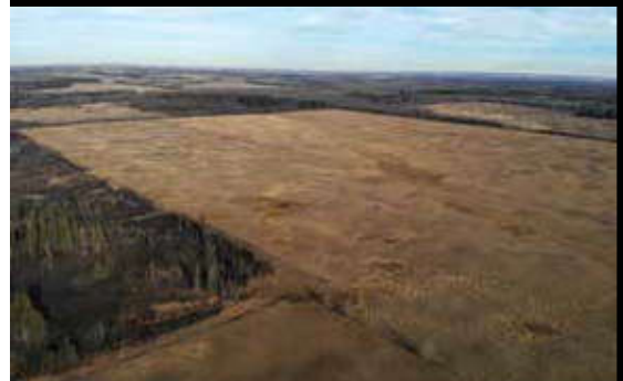
A-3 SW 7 64 24 W4

Approx. 8 acres treed, remainder open pasture, road allowance access approx. half way down, one cut of hay and then pastured taxes $240.80