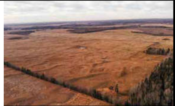
A-8 NW 29 63 24 W4