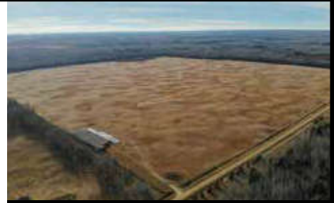
A-4 NE 36 63 25 W4

Check out our virtual tour of the home on our websites www.teamauctions.com and www.brandiwolff.ca