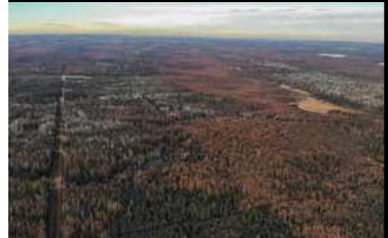
A-10 GRL 040085