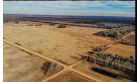
A-6 SW 5 64 24 W4