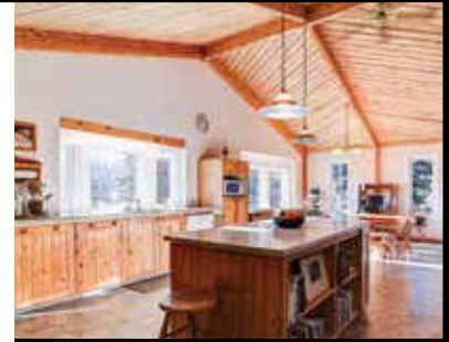
VAULT CEILING, WOOD CABINETS