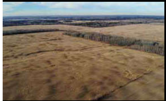
A-3 NW 6 64 24 W4

NW 31 has approx. 75 acres cultivated, 20 acres treed, remainder grass for pasture, 4 wire fence, water, taxes $193.66 SW 31 63 24 W4 mostly treed taxes $42.28