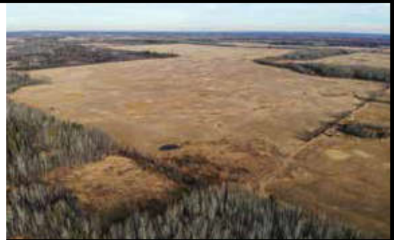
A-2 NE 1 64 25 W4

NE 1 has approx. 23 acres of trees remainder grass for pasture, fenced w/ 4 & 3 wire fence, abandoned well site (currently being cleaned up) taxes $235.47 SE 1 has approx. 14 acres of trees, 80 acres older hay (did produce 200 bales when fertilized) remainder grass for pasture, water at north & south end of quarter taxes $226.30