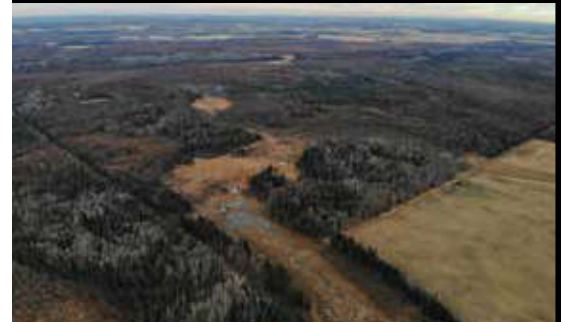
A-10 GRL 040085