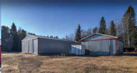
40X80 COLD STORAGE & 28X40 HEATED SHOP