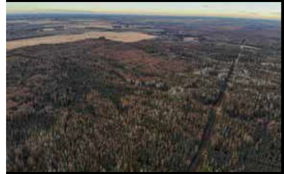
A-10 GRL 040085